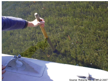
A thick infestation of hydrilla in Pickerel Pond in Limerick, Maine.