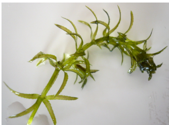
Hydrilla grows underwater. It has narrow, blade-shaped leaves arranged in whorls of four to eight.