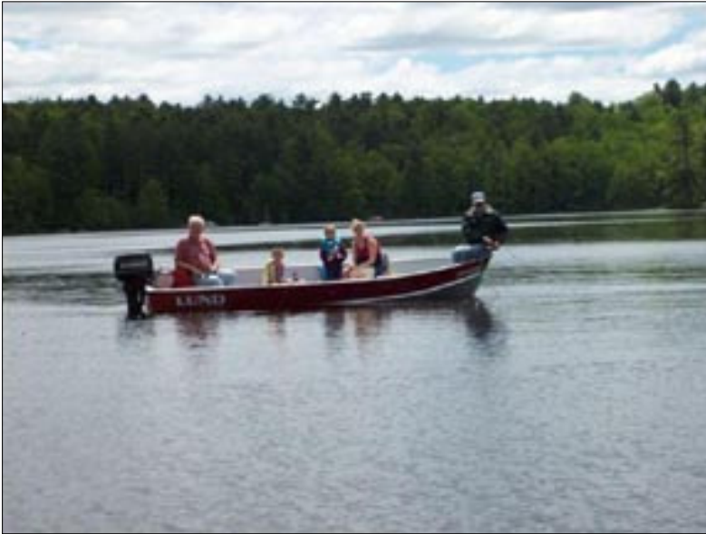
Good weather, good company, and the fish were biting.

GOOD STEWARDS OF THE WATERSHED THAN TO FOR FUN ON THE LAKE?